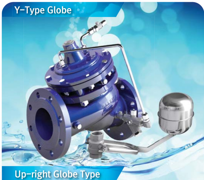
Up-right Globe Type